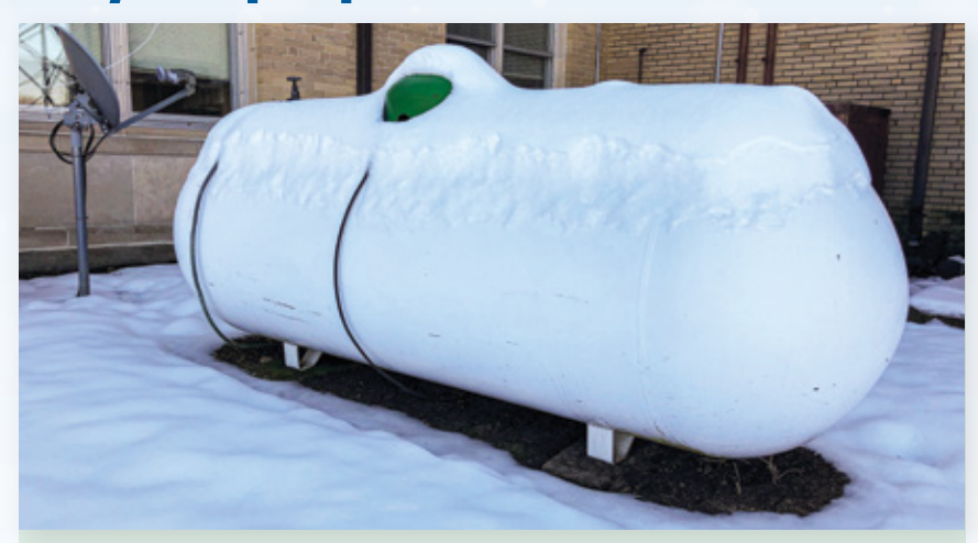
Keeping your propane tank free from snow and ice will allow your propane provider safe and easy access to service your tank.