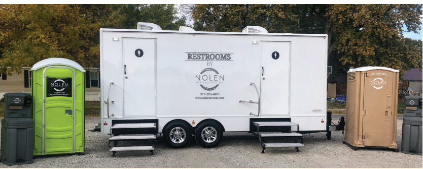
Nolen Restroom Rentals range from the typical on-the-job-site variety to an all-inclusive luxury bathroom set up.

Daniel introduced the septic plumbing and portable restroom rental service into their business model in 2019 with the initial goal to set 56 units at Lake Taylorville. However, the new service took off like wildfire, and they now have over 1,000