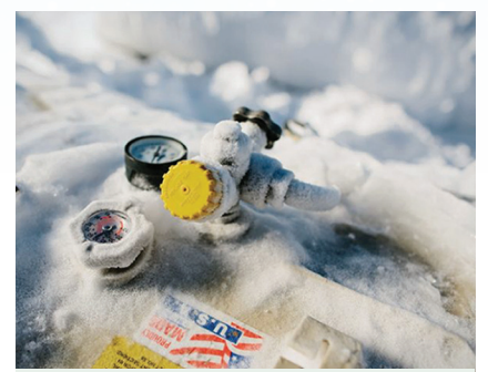
Try to keep your propane equipment free from snow and ice.

Winter can produce some of the most magnificent scenery, but it can also be challenging. Accumulated snow and ice have the potential to damage your propane system. While you can not always predict snowstorms or hazardous weather conditions, you can take measures during and after winter storms.