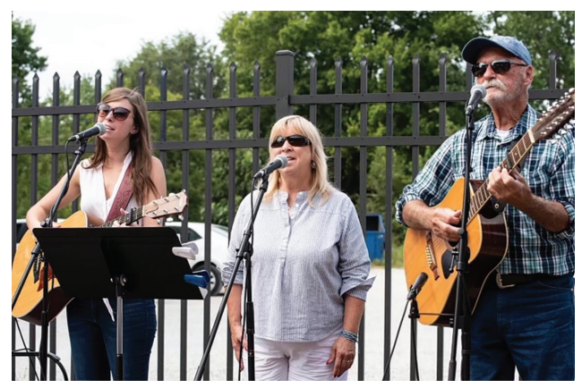
The Hood Family Band

If you didn't receive your annual meeting notice or misplaced it, call the cooperative at 217-774-3986.