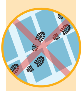
Never walk on solar panels.