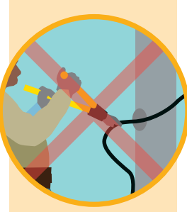
Never cut any wiring to the solar panels.