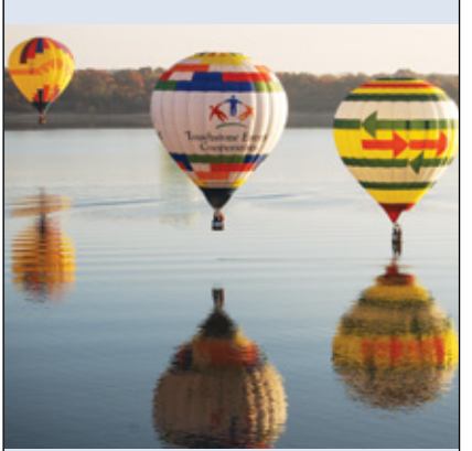
Hot air balloons will visit Lake Shelbyville Columbus Day weekend. Find more details by searching Lake Shelbyville Balloonfest on Facebook.

Touchstone Energy Hot Air Balloonfest at Lake Shelbyville October 11 - 13