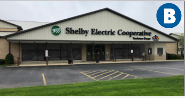
Pictured above are the subtle changes in the appearance of the current exterior (A) to the new exterior (B) when the work is completed. Energy efficient windows and the addition of a drive-up window are the planned improvements.