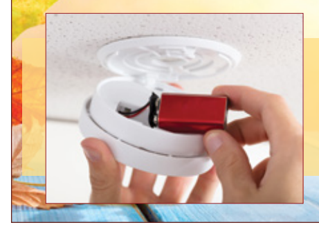
Local fire officials recommend changing the batteries in your smoke detector(s) at this time.

Daylight saving time ends at 2 a.m. on Sunday, November 7. Remember to set you<mark>r clocks back one hour before you go to bed on Saturday evening.</mark>